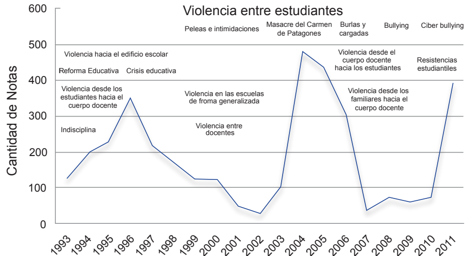
Figure 3: Sense sliding