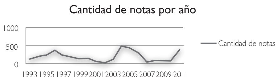
Figure 1: Paper news per year.

The appearance in print media of the phenomenon of violence in school fluctuated during the period assessed. In Figure 1 the news per year.